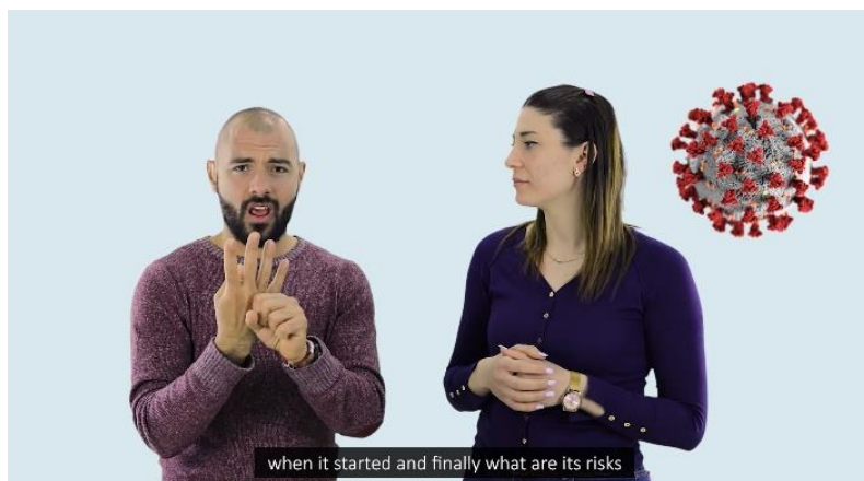
Screenshot from the video IFES produced in Tunisian Sign Language to share information on COVID-19 with Deaf Tunisians.

Tunisia: In recognition of the barriers Deaf Tunisians face accessing information during COVID-19, IFES developed a video in Tunisian Sign Language to share information about the pandemic with Deaf communities. The video is being distributed by the Ministry of Social Affairs. In May 2020, IFES produced