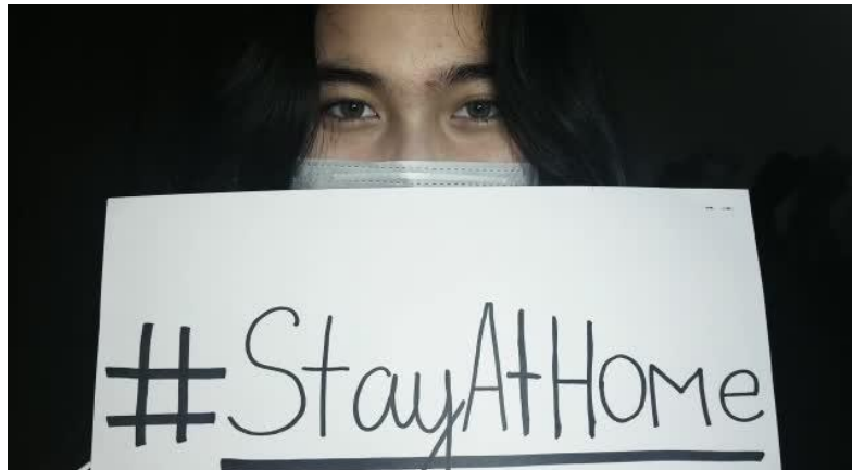
Kyrgyz Democracy Camp alumni encourages other young people to adhere to COVID-19 lock-down precautions.

Sri Lanka and Bangladesh: Throughout August and September 2020, IFES led a series of remote TOT sessions on its' Power to Persuade methodology for IFES staff and partners in Sri Lanka, supported by USAID , and Bangladesh, supported by DFID . The methodology for both trainings was updated to integrate advocacy strategies for participants to engage in while remaining safe at home during the pandemic. Since the training in Bangladesh included some men with disabilities, in addition to women with disabilities, the curriculum was updated to feature a session on being an ally.