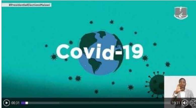
A screenshot of a voter education video produced by the Malawi Election Commission ahead of the June 2020 elections which included sign language interpretation.

Malawi: In May 2020, the Malawi Electoral Commission (MEC), with support from IFES, produced a series of inclusive voter education videos as part of the “My Country, My Choice” campaign to inform voters of electoral procedures ahead of the June 2020 Presidential elections. The videos, which included sign interpretation, provided information about MEC measures to mitigate the spread of COVID-19 and enhance the effectiveness of the electoral process. Supported by USAID.