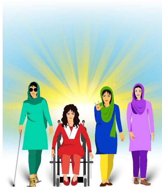
IFES' logo for the Power to Persuade Online pilot in Pakistan.