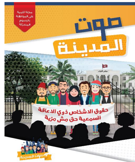
Cover of “The Voices of the City” (Sout Al Madina) comic book which features Deaf characters in front of the Tunisian Parliament building holding a sign which reads “The rights of Deaf and hard-of-hearing persons are an obligation and not a favor.”