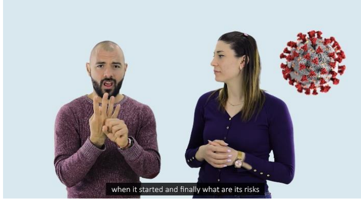
Screenshot from the video IFES produced in Tunisian Sign Language to share information on COVID-19 with Deaf Tunisians.

and are utilizing the Power to Persuade curriculum to design and implement advocacy initiatives. IFES and PDF are also implementing a Strategic Communications and Advocacy Online workshop to train women with disabilities to develop impactful messages on the policy platform. To promote inclusive reporting during COVID-19, IFES and PDF will train journalists in rights-based reporting techniques using IFES' Media Empowering Disability Inclusion and Access (MEDIA) guidelines and training. The training will also provide the opportunity for women advocates with disabilities to learn how to engage