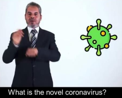
A screenshot of a video in Libyan Sign Language on COVID-19 produced by Zaykum Zayna.