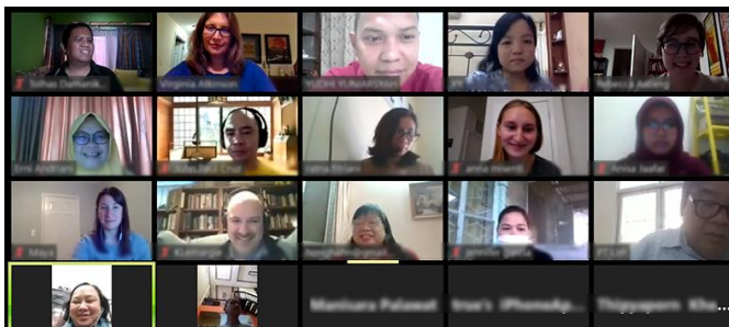
IFES and DPOs participate in a video call to discuss how to adapt AGENDA regional advocacy in the context of COVID-19.