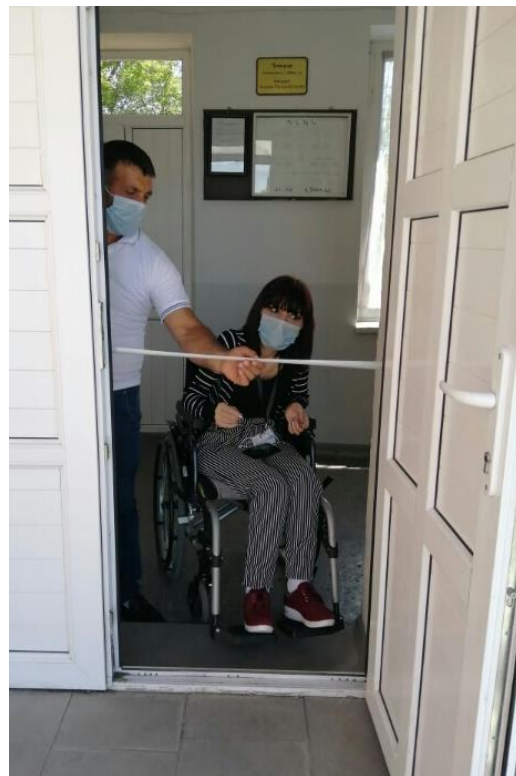
A man and a woman using a wheelchair wear masks as a safety precaution to prevent against COVID-19 during a polling station audit in Armenia in June 2020.

Bolivia: With IFES support, Bolivia's Plurinational Electoral Body is adapting their in-person poll worker cascade trainings to online trainings using a virtual platform. As part of the online trainings, IFES is supporting the development of video tutorials with sign language interpretation to ensure materials are accessible for all participants. Supported by USAID.